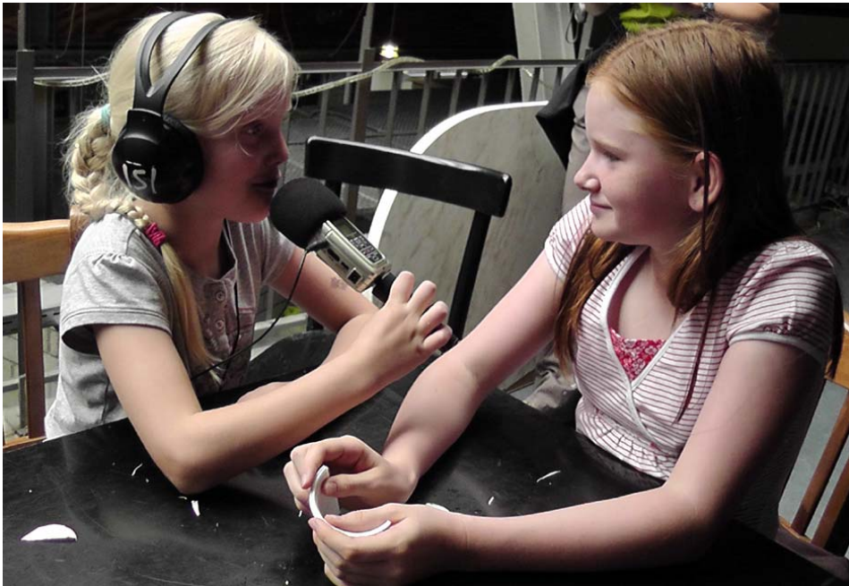
Vacation Course at Münster