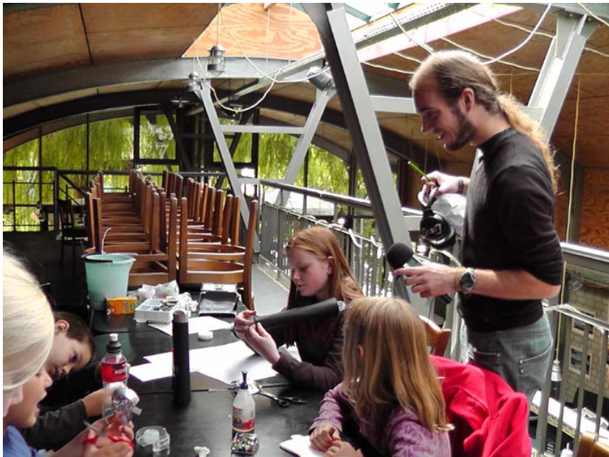
Vacation Course at Münster