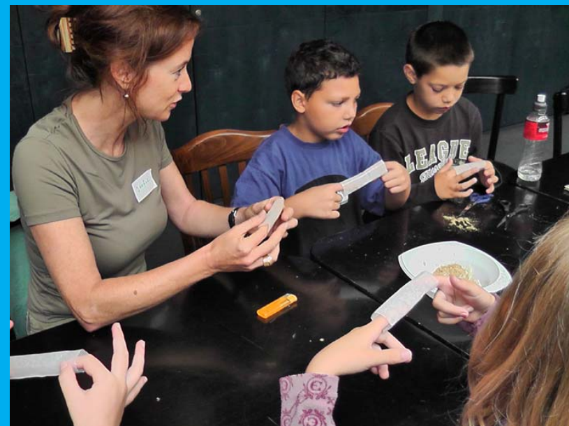
Vacation Courses at Dortmund (above) and at Münster (below)