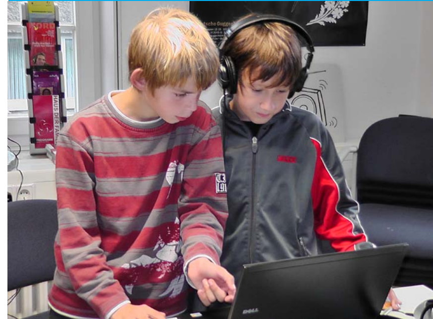
Vacation Course at Bonn

What does that mean, where can we use what kind of renewable energy? What are the chances and what are the problems by using them?